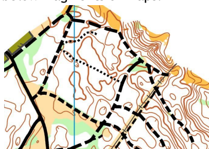
mass-start, long distance